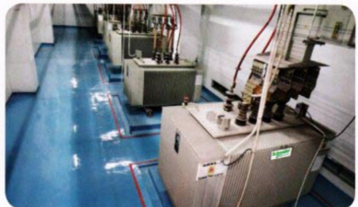
Thamrin City, Shopping Centre and Apartement, Jakarta - Indonesia