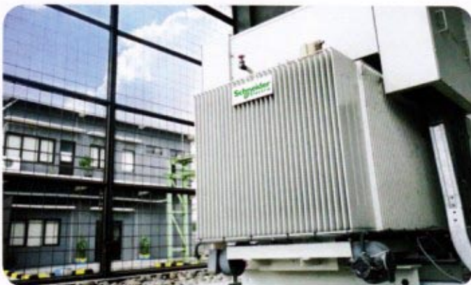
IKPP, Serang - Indonesia